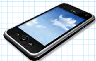
CELLULAR IP SOFTPHONES

INTRODUCING A NEW LEVEL OF BUSINESS TELECOMMUNICATIONS BACKED BY A 3-YEAR WARRANTY