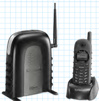
ENGENIUS DURAFON Range of up to 10km