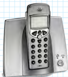
DECT & IP SOFTPHONES